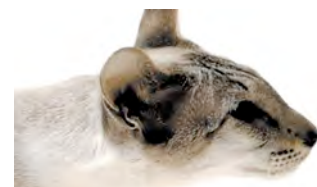
Tabby Point (Seal Tabby Point)