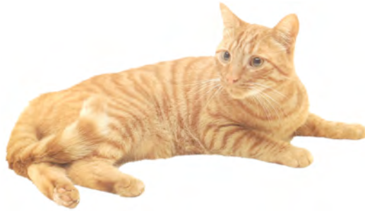
Mackerel Tabby (Red Mackerel Tabby)