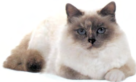
Tortie Point Tortoiseshell pattern on points.