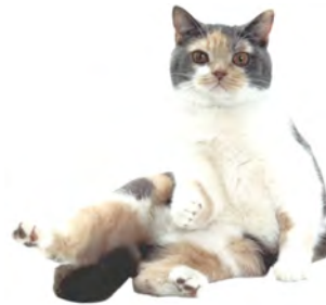
Dilute Calico Same amount of white as calico with distinct patches of solid blue and cream tabby.