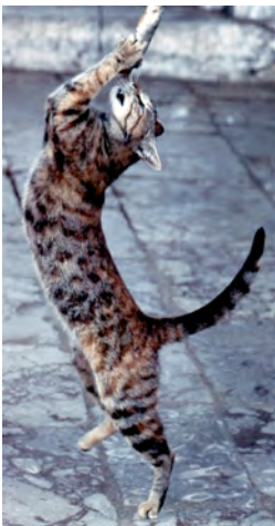
Brown Torby (Brown Spotted Torby) Patches of brown tabby and red tabby.

Tortoiseshell cats with tabby patterns. Torties because of random color variation , but tabbies due to the patterns in the coloration. Torbies are also called patched tabbies.