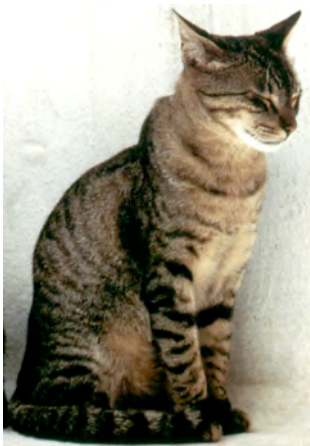
Brown Mackerel Tabby with Brown Field Black stripes with brown background.

Distinct color patterns with one color predominating. Black stripes ranging from coal black to brownish on a background of brown to gray. Brown mackerel tabbies are the most common.