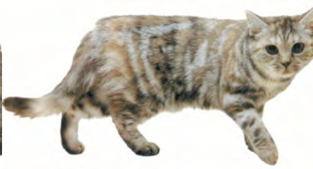
Dilute Torby (Blue Classic Torby) Patches of blue tabby and cream tabby.