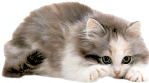
Dilute Tortie and White Small white areas with mingled blue, and cream colors.