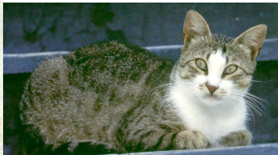
Brown Mackerel Tabby with Gray-Brown Field Black stripes with gray-brown background.