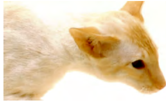
Red Point AKA Flame Point