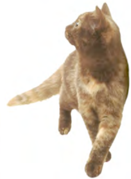
Chocolate Tortie Chocolate mingled with red and cream.