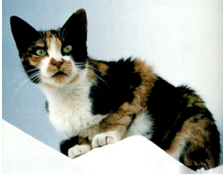
Tortie and White Small white areas with mingled red, black and cream colors.