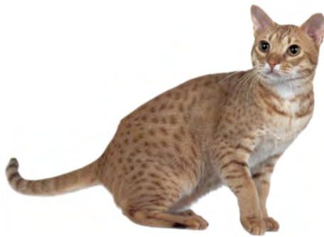
Spotted Tabby (Chocolate Spotted Tabby)