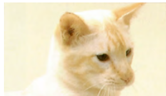
Tabby Point (Red Tabby Point)