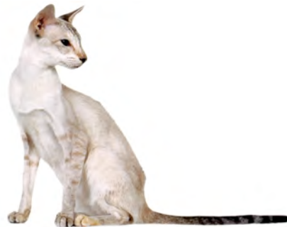
Torbie Point Both striped and tortoiseshell patterns on points.