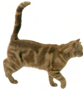
Classic Tabby (Chocolate Classic Tabby) AKA Blotched Tabby