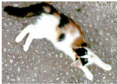
Calico Tortoiseshell with large patches of white. Red tabby and solid black patches more distinct.