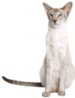
Tabby Point (Lilac Tabby Point) AKA Lynx Point Striped pattern on the points.