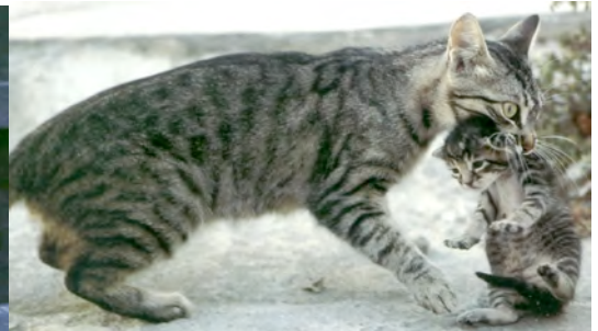
Brown Mackerel Tabby with Gray Field Black stripes with gray background.