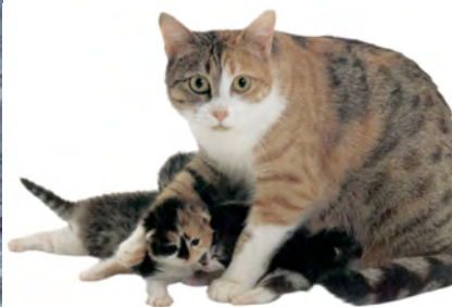
Brown Torby and White (Brown Spotted Torby and White)